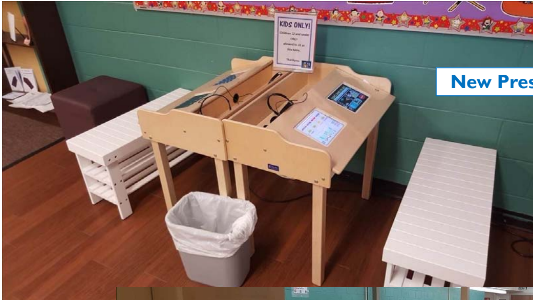
New Preschool iPad Tables