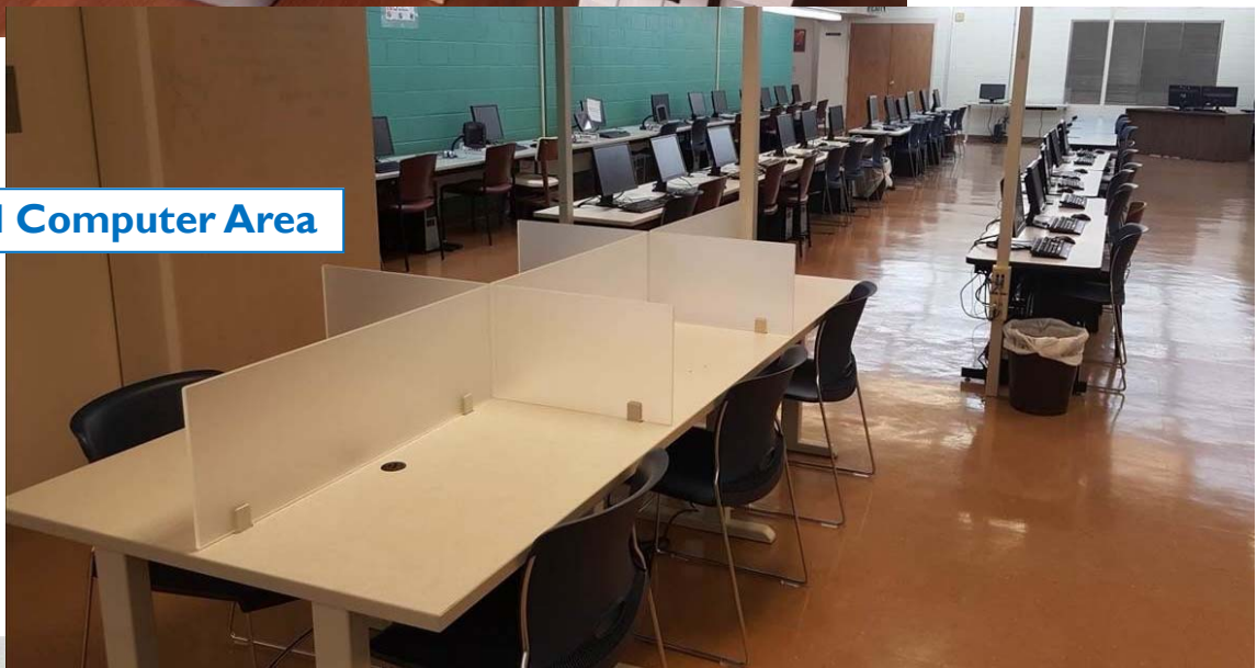
Remodeled Computer Area