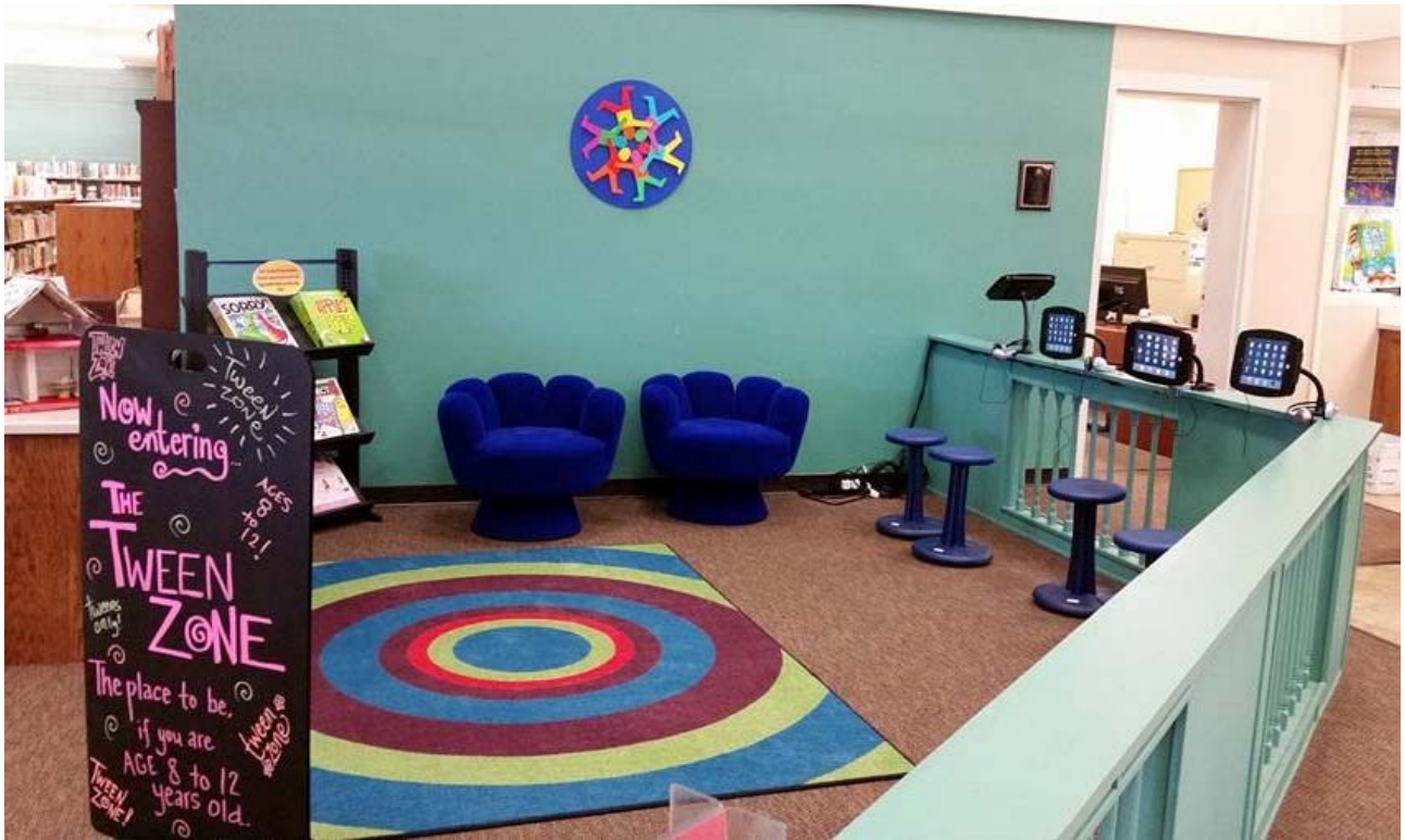
The Children's Department has added an area just for "Twins" (8-12 year olds), they have also added new shelving.