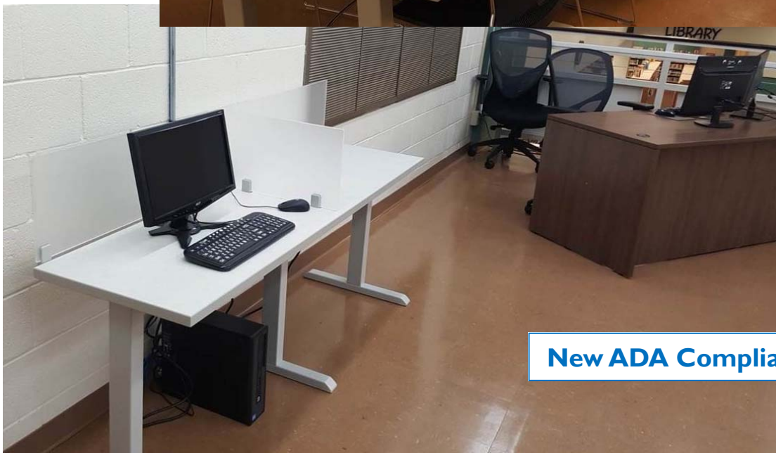
New ADA Compliant Computer